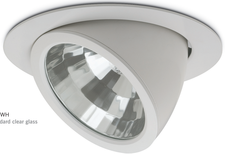
➤ JC16055WH with standard clear glass