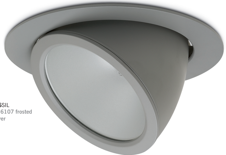
➤ JC16056SIL with JC16107 frosted glass cover